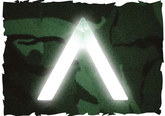
IR Night Vision Image

Manufactured by an ISO 9001 certificated UK company. The EXIUM infrared reflective "UpArrow" inverted V marker uses a superior metallised prismatic retro-reflective base material. This produces a high grade infrared reflective signature with a IR transmission value of >70% at 835nm, viewable over 800m using a PVS-14 night vision device. UpArrow markers have a matt diffuse pattern finish on a clear abrasion resistant coating giving superior performance and durability in aggressive operational environments.