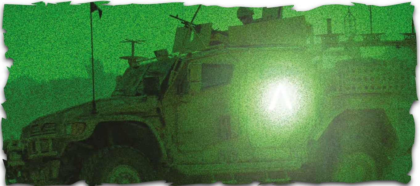
IR Night Vision Image

REDeye™ products transmit a high intensity infrared reflective signature with an IR transmission value of >70% at 835nm. Using an IR capable PVS-14 night vision device items in the REDeye™ product range can be identified at over 800 metres. EXIUM combat identity products are customised to meet the specific construction, infrared performance and visual signature requirements of our military, security and police clients worldwide.